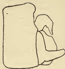
FIG. 7.— Ischnura barberi n. sp., profile view of 10th abdominal segment and appendages of ♂. × 24.